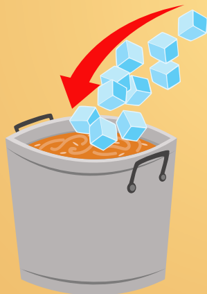
Adding ice or cold water as an ingredient